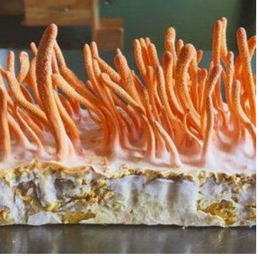
about growing and new kinds