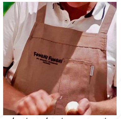
buying, cleaning, preserving

Presentations on location we organize for larger groups, during fairs or inspiration days. We present a selection of actual available mushroom types on just a few square meters. We are present to inform and inspire the attendees. Whether or not combined with, for example, a masterclass, tasting or cooking demo.