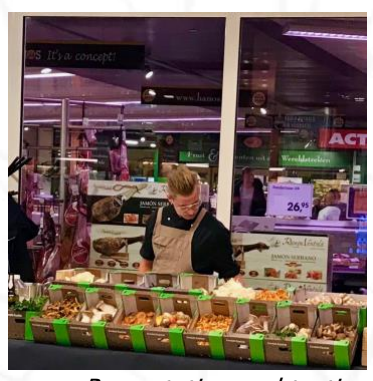
Presentation and tasting